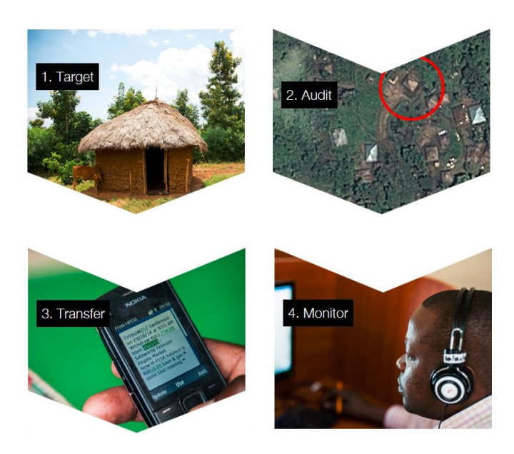
Figure 1: Program model for GiveDirectly, an end-to-end cash transfer program.

Question: You mentioned that intermediaries have downsides. But, all the auditing that you have to do might be more efficiently done by a local organization. What are the downsides of having the end-to-end process done by one organization rather than getting local organizations involved? Answer: The main downside to intermediaries is having worse bribe control. It is harder to make sure that the right people get the money. There is less information and reduced ability to fire cheaters. Ultimately, you're trusting someone else to disburse the money if you use a local organization. In terms of cost, it's unclear. The main issue is that if you want to grow something quickly, then doing it yourself takes time.